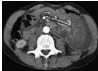
Fig. 2 Contrast-enhanced computed tomography (CT) scan showing telescoping of proximal small bowel and mesenteric vessels into the stomach.

the intussuscepting loop as type I (afferent loop), type II (efferent loop, most common type), and type III (combined) [4]. Endoscopic reduction has been described but emergency surgery is the definitive treatment. Surgery may involve bowel loop reduction or resection depending on its viability [5]. Awareness and prompt recognition is vital for minimizing morbidity and mortality.