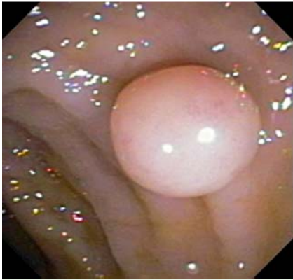
Fig. 1 Colonoscopic image demonstrating the pedunculated polyp in the sigmoid colon.