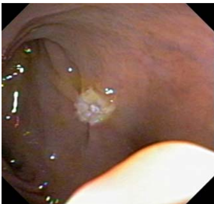
Fig. 2 Colonoscopic image following complete removal of the polyp by hot-snare polypectomy.