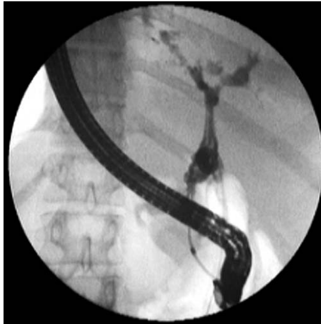
Fig. 1 Fluoroscopic image during endoscopic retrograde cholangiopancreatography (ERCP) showing the presence of the migrated T-tube.

Endoscopic retrograde cholangiopancreatography (ERCP) was performed after the patient had received initial treatment with prophylactic antibiotics. A stricture was observed in the lower CBD, which was dilated using a 10-mm biliary balloon. The T-tube had a radio-opaque marker, but this was absent because of guttering of the tube at the time of deployment; hence the T-tube was not visible inside the CBD fluoroscopically (▶ Fig. 1). An endoscopic sphincterotomy was performed. The end of the T-tube arm nearest to the sphincter was grasped with foreign-body grasping forceps and the whole 50-cm length of the T-tube was extracted (▶ Fig. 2). Following the procedure the patient improved and had no complaints during follow-up for 1 year. The complications of T-tube retrieval include bile leakage, peritonitis, bacteremia, retention of a fragment, and stenosis [1]. There are a few reports of patients with complications from retained remnant T-tube fragments [2–5]. To the best of our knowledge, this is the first report of the whole length of a T-tube having migrated into the peritoneal cavity and its successful endoscopic management. The technique applied in this case, which is simple and feasible, provided a method for the endoscopic removal of a T-tube that had undergone intraperitoneal migration,