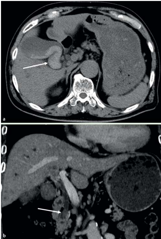
Fig. 2 Abdominal computed tomography (CT) showing high-density fluid in: a the gallbladder (arrow) and b the lower bile duct (arrow).