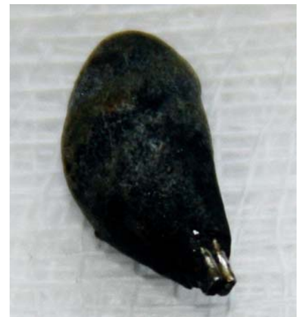
Fig. 2 The extracted 10-mm black calculus with a metallic protuberance at one end.

CBD (Fig. 1a, b), in addition to the cholecystectomy clip that was seen at the cystic duct. Cholangiogram revealed that this foreign body was located in the center of a 10-mm oval-shaped defect that was suggestive of choledocholithiasis (Fig. 1c). A sphincterotomy was performed, after which removal of a black calculus was achieved with a retrieval balloon, and a subsequent repeat cholangiogram was normal. On further examination, the calculus was found to have a metallic protu-