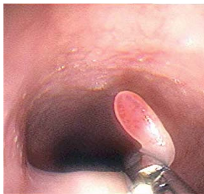
Fig. 3 Endoscopic resection of a fibrovascular polyp of the esophagus with standard forceps.

Fibrovascular polyps of the esophagus are rare benign lesions that arise from the cervical esophagus. Most of them are only diagnosed when their size induces symptoms [1].