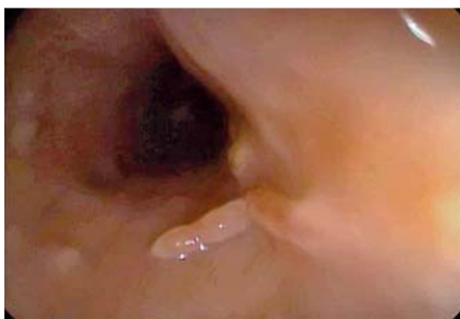
Fig. 2 Case of fibrovascular polyp of the esophagus with two polyps.