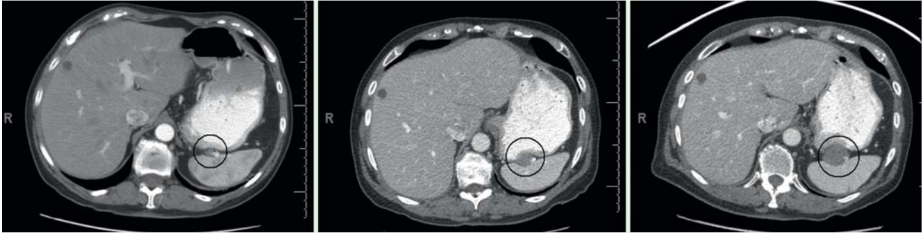
Fig. 1 Serial re-staging abdominal computed tomography (CT) scans showing the gradually increasing size of the splenic hilar soft-tissue mass (circled), which was well-circumscribed and appeared avascular. Also seen is a simple cyst in the liver, which remained stable on these serial scans.