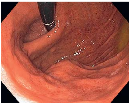
Fig. 2 Esophagogastroduodenoscopy image revealing an approximately 3-cm subepithelial compression in the gastric fundus.