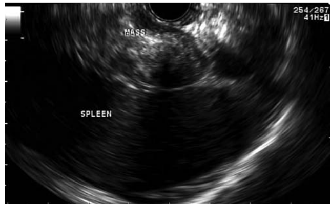
Fig. 3 Endoscopic ultrasound image demonstrating a 3.5 × 2.36-cm, oval-shaped, hypoechoic, heterogeneous splenic hilar mass with well-defined borders and scattered hyperechoic foci.