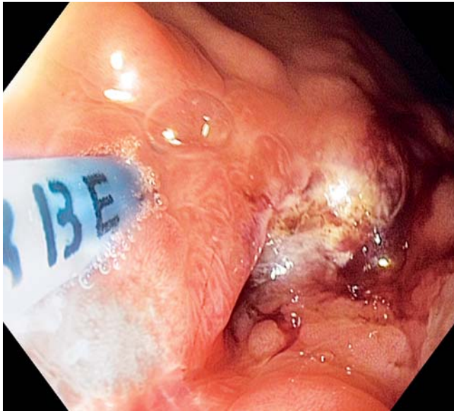
Fig. 1 The fistula track is treated with argon plasma coagulation.