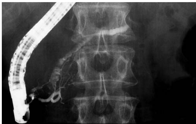
Fig. 1 Endoscopic retrograde cholangiopancreatography (ERCP) showed stricture of the main duct in the head of the pancreas.

2 Department of Endoscopy, Mie University Graduate School of Medicine, Mie, Japan