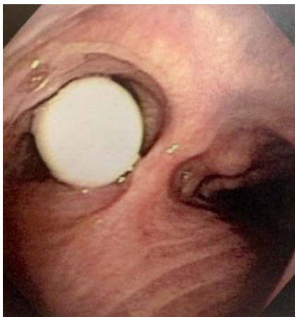
Fig. 2 The capsule endoscope was identified in the left main stem bronchus by fiberoptic bronchoscopy.

Capsule endoscopy is a commonly employed technique to examine patients for gastrointestinal pathology. Pulmonary aspiration of a capsule endoscope is a rare complication of this procedure. There have been 15 well-described instances of