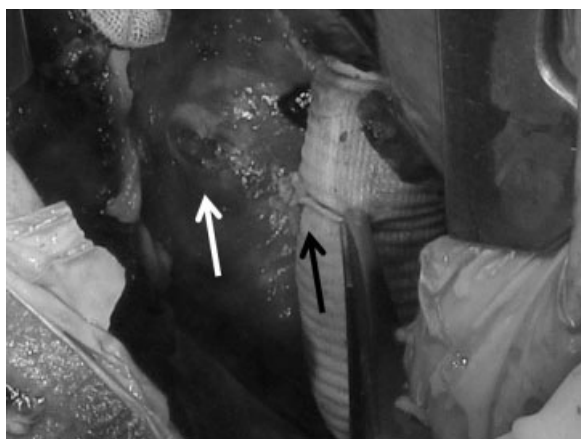
Fig. 3 Operative findings. The black arrow shows the repaired rupture site of the graft. The white arrow shows the rib without periosteum.

by intrinsic factors such as degeneration of graft fibers has been reported previously, 1 graft rupture due to extrinsic damage caused by mechanical stress is rare. To the best of our knowledge, only three recent reports have shown Dacron prosthetic ruptures caused by direct damage, such as contact with the rib stump or aortic calcification. 2-4 However, there have been no reports of graft rupture due to contact with the smooth surface of the rib. In the present case, during the previous repair, the coverage of the Dacron graft with aneurysmal sac to prevent this complication could not be applied because the major part of infected aortic wall was removed. Alternatively, xenopericardial neoaortas or homografts were not routinely available in our country. The Dacron graft was placed slightly more laterally, away from the infected bed. Subsequently, the graft was positioned close to the rib. Repeated graft pulsation may have resulted in gradual damage by friction against the rib surface, resulting in injury of the graft. In particular, Gelweave woven Dacron prostheses have a thin wall, which may be related to the rupture. To avoid such complications, the graft should be positioned away from the ribs or aortic calcification.