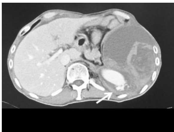
Fig. 2 A computed tomographic scan demonstrating active contrast extravasation (arrow) and a massive hematoma around the graft.