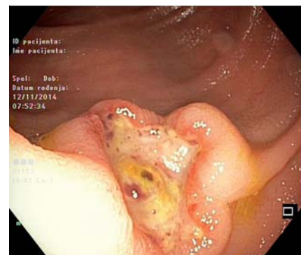
Fig. 4 Follow-up colonoscopy at 7 days revealed a post-polypectomy ulcer.