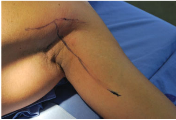
Fig. 1 Incision in the arm.