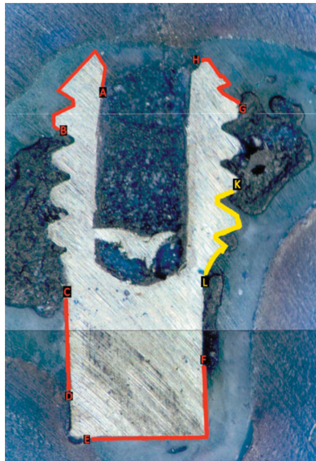
Fig. 1 Scheme of cortical and trabecular bone measures

During the experimental period, the animals were weighted at the day of the sacrifice. The mean weight of the control group was 395.33 g ( \pm 32.73 ), while in the experimental group the mean weight was 403.38 g ( \pm 31.56 ). No statistically significant difference was found between the groups.