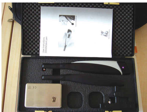
Figure 1. A set of laser fluorescence device (DIAGNOdent Pen, Kavo, Germany).

Enamel decalcification around orthodontic bands and brackets has long been a concern. 1 Studies showed that orthodontic appliances increase the accumulation and adherence of plaque in mouth. 2 Streptococcus mutans and Lactobacillus concentrations in the oral cavity increase in conjunction with orthodontic treatment and fixed appliances. 3 These and other bacteria ferment carbohydrates to produce organic acids. These acids can, over time, lead to the dissolution