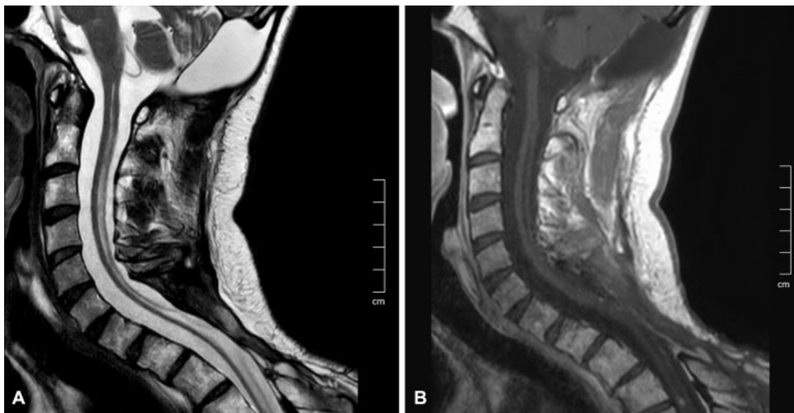
Fig. 3 Magnetic resonance imaging scans of the cervical spine 60 months after radiotherapy. T2-weighted (A) and contrast-enhanced T1-weighted (B) images demonstrate a considerable collapse of the cervical portion of the syrinx after resection of the cervicothoracic hemangioblastoma.

Although surgical resection constitutes the therapy of choice for spinal HABs, radiotherapy has become increasingly