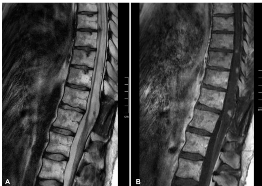
Fig. 4 Magnetic resonance imaging scans of the thoracic spine 60 months after radiotherapy. T2-weighted (A) and contrast-enhanced T1-weighted (B) images show partial collapse of the thoracic portion of the syrinx and stable-sized contrast enhancing lesions after radiotherapy.

important for the treatment of surgically not amenable lesions in both cranial and spinal locations. 8-22