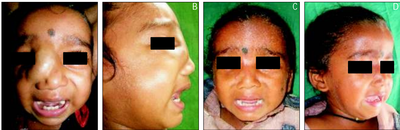
Figure 4: Pretreatment photographs of a child with hemangioma at the base of nose in A) frontal view and B) profile view. Follow – up photographs of same patient following steroid treatment and surgical resection in C) frontal view and D) lateral view.