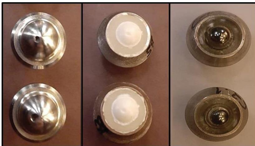
Fig. 3 Deformation in the indenters used in the application of cyclic loading; stainless steel (left), and steatite ceramic (middle) showed clear deformation compared with the tungsten carbide indenters (right).

that the stainless steel and ceramic indenters produced very close results. This may be explained by the relatively close modulus of elasticity of the two materials compared with that of tungsten carbide indenters. Therefore, using indenters that have high-elastic modulus values compared with that of natural dentition like tungsten carbide may lead to over expectation of the performance of zirconia in the clinical service.