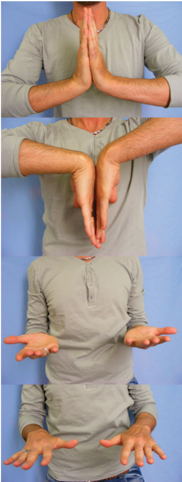
Fig. 4 Clinical results after 2 months (the same patient as in ►Fig. 3).

Further research would therefore be needed considering different hardware, such as a compression screw, with and without PRP, to compare these results.