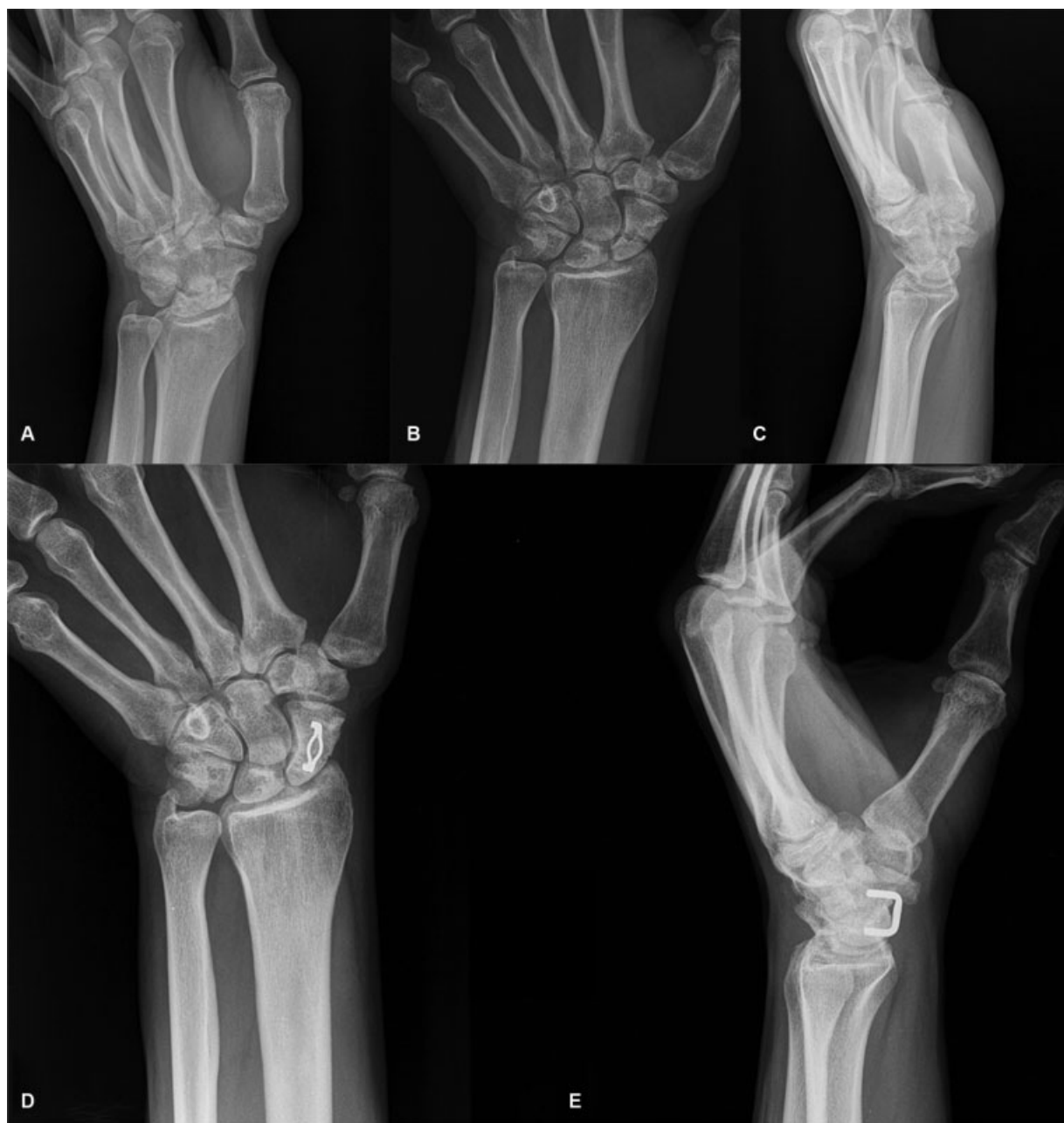
Fig. 3 A 32-year-old male patient with scaphoid nonunion in the left hand, with time passed from trauma of 12 months. (A–C) Preoperative radiographs. (D,E) Postoperative radiographs (2 months after surgery).

The staple gives strong stability and properly compresses the nonunion site.