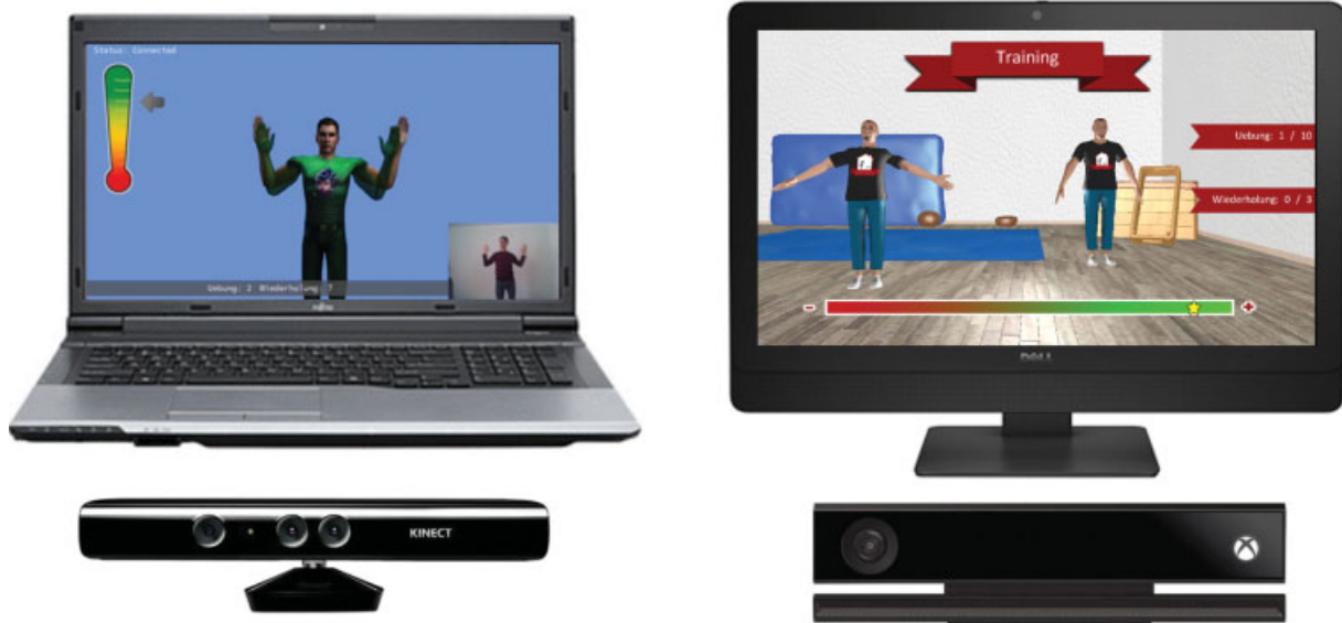
Fig. 1 Training scene in AGT-Reha-V1 (left) and AGT-Reha-V2 (right) in comparison.

based on automatically and securely transmitted exercise data. This comprises only quantity and quality of trainings. Video is neither recorded nor transmitted.