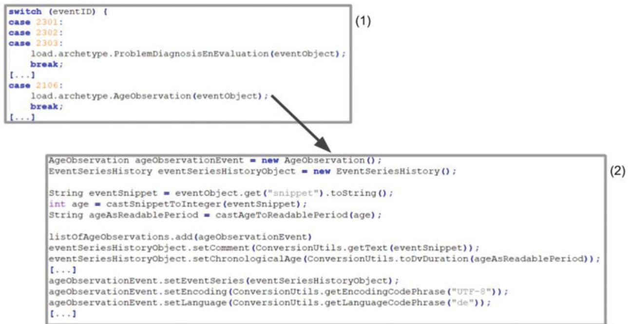
Fig. 3 Snippet from the Java code for mapping the extracted information snippet on unique archetype paths (mapping and integration module), including (1) running through all defined rules and the firing of a suitable rule which then (2) enables the instantiation of a new age observation by filling the associated archetype paths with the extracted information delivered in the eventObject.

“headache” and “no headache” because the two words are handled as both two separate markers and one event. To prevent the integration of contradictory information, in this case, the negated information will be preferred. Because of the described contradictory or overlapping components, 18 of 32 extracted snippets were mapped onto archetypes and, in a fourth step, integrated into an openEHR-based data repository.