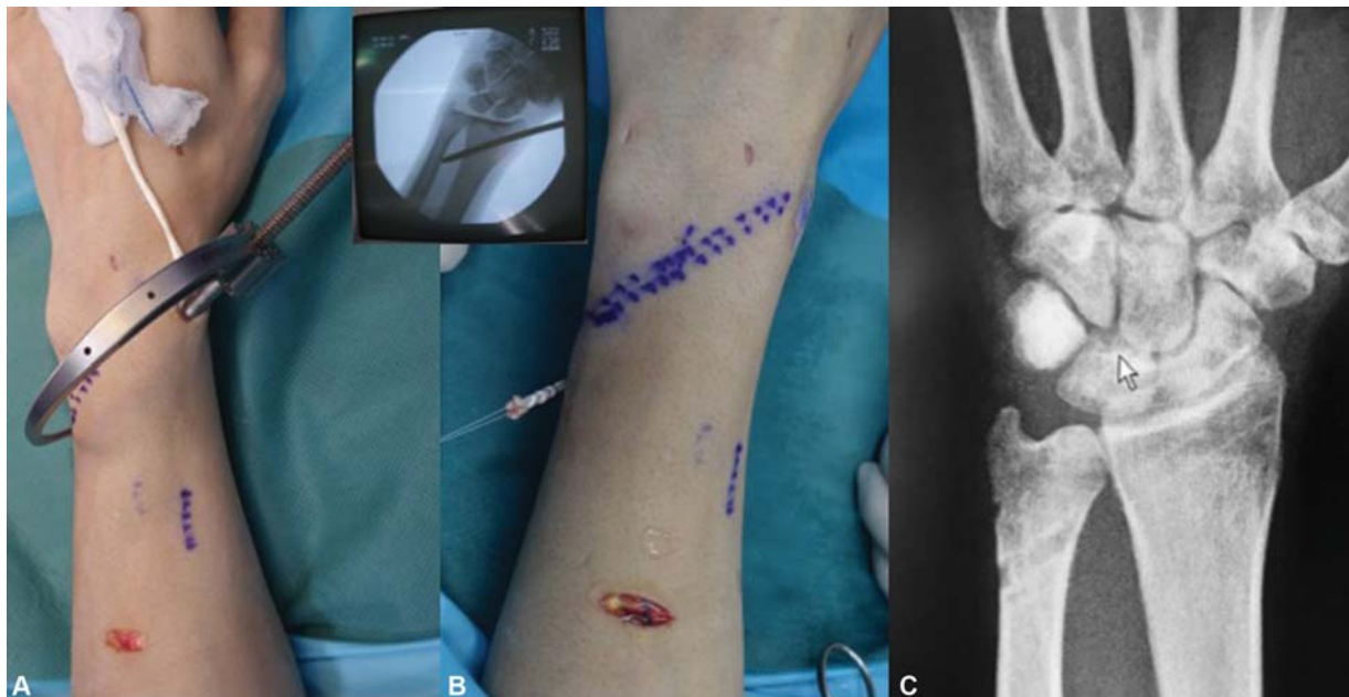
Fig. 3 Reconstruction of the distal oblique bundle. (A-B) Intraoperative images. (C) Postoperative radiograph.

Recently, articles such as the one by Low et al. 9 reported similar outcomes from the reconstruction of radioulnar ligaments and of the DOB.