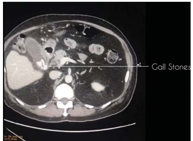
Fig. 1 CT image showing gall stones and surround peri gall bladder fat stranding. CT, computed tomography.

The patients are operated under general anesthesia using the standard four-port technique. A few technical modifications are advocated in cases of severe inflammation. A distended