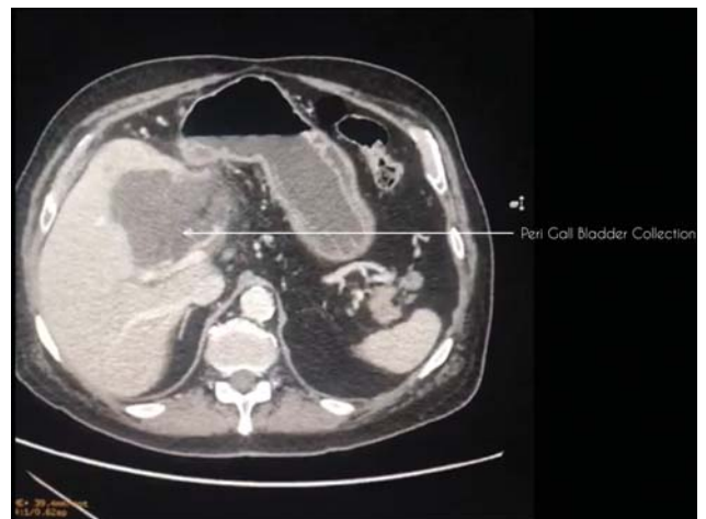
Fig. 2 CT image showing collection in the gall bladder fossa suggestive of a perforated gall bladder. CT, computed tomography.

GB is decompressed with an 18-Gauge spinal needle and GB bile is sent for culture and antibiotic sensitivity. Dissection of the posterior leaf of peritoneum covering the neck of the GB is commenced above the Rouviere's sulcus and effective retraction of the GB is ensured to dissect the Calot's triangle and achieve the critical view of safety (CVS).