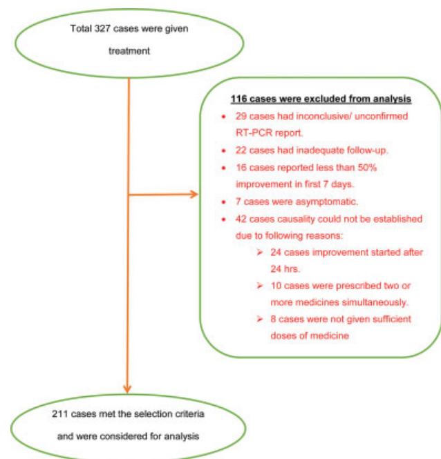
Fig. 1 Flowchart of the study.