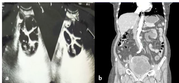
Fig. 1 (a) Ultrasound of the pelvis showing complex cystic lesion posterior to the bladder, likely arising from the left adnexa. (b) Computed tomography of the pelvis showing multiloculated cystic lesion in the pouch of Douglas, displacing the pelvic structures with bilateral hydronephrosis.