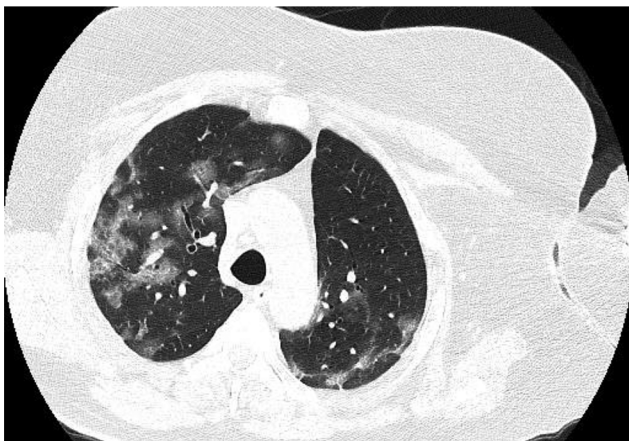
Fig. 1 High-resolution CT (HRCT) lung showing ground glass opacities in the coronavirus disease (COVID)-positive patient.