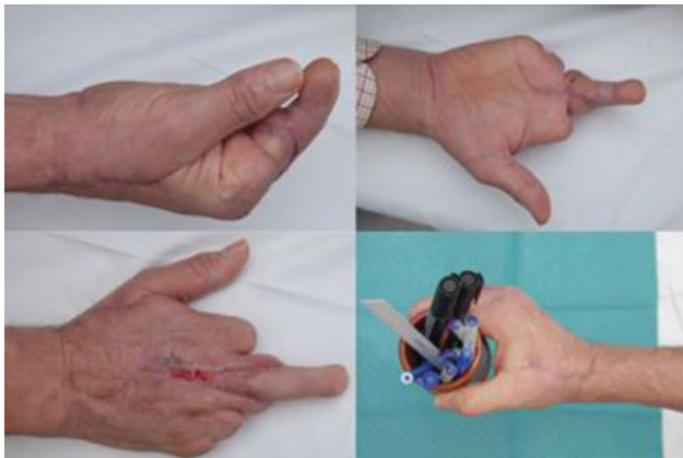
Fig. 4 Outcomes two months after the first transfer.

nerve regions from the third and fourth fingers respectively. The patient has no gait disturbances (► Figures 7 and 8 ).