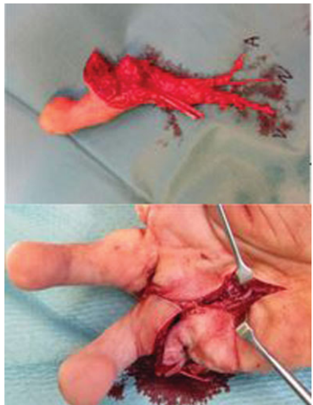
Fig. 6 Images of the transfer of the second toe from the right foot to the fourth radius. At the top, the figure shows (up) the free flap and its artery (A), the planar nerve (N), and the dorsal vein (V). (Down) Image from the transfer after arterial anastomosis.

without thumb involvement. In addition, these authors proposed that a metacarpal hand with an adequate thumb length (usually intact) would be further classified as “type I”; in contrast, a “type II” metacarpal hand presents an inadequate thumb length. The minimum acceptable length in an amputation spares at least the proximal half of the proximal phalanx in triphalangeal fingers and the complete first