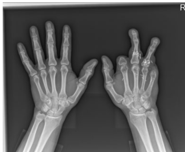
Fig. 8 Radiograph five years after the second transfer.

Replantation viability must be assessed after debridement. It is not uncommon for the viability to be low due to