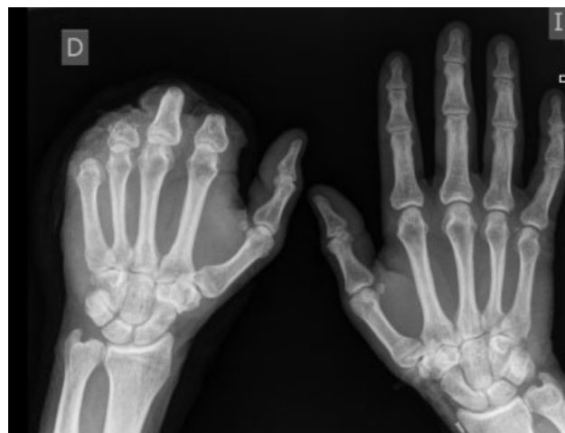
Fig. 2 Radiograph before the first transfer.