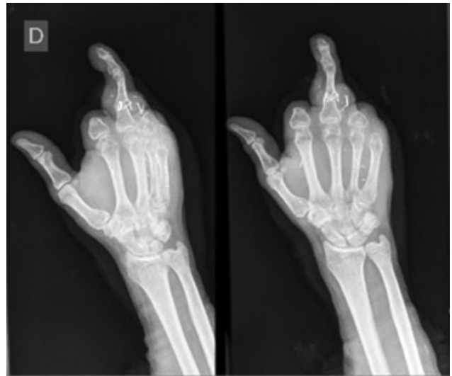
Fig. 5 Radiograph after the first transfer.

The most accepted definition for the term metacarpal hand was proposed by Wei et al. 5 in 1997. According to these authors, this term describes a hand that has suffered a traumatic amputation of the triphalangeal fingers, not maintaining a minimum acceptable length for any of them, with or