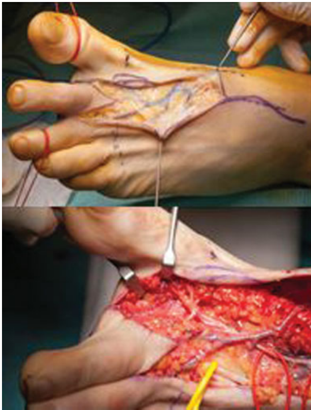
Fig. 3 Intraoperative detail during the harvesting of the second toe of the left foot. The dissection of the superficial venous network on which the venous drainage of the flap will be based is on the left side. The dorsal vein, first dorsal metatarsal artery (red vessel loop) and extensor tendon (yellow vessel loop) are at the right side of the image.