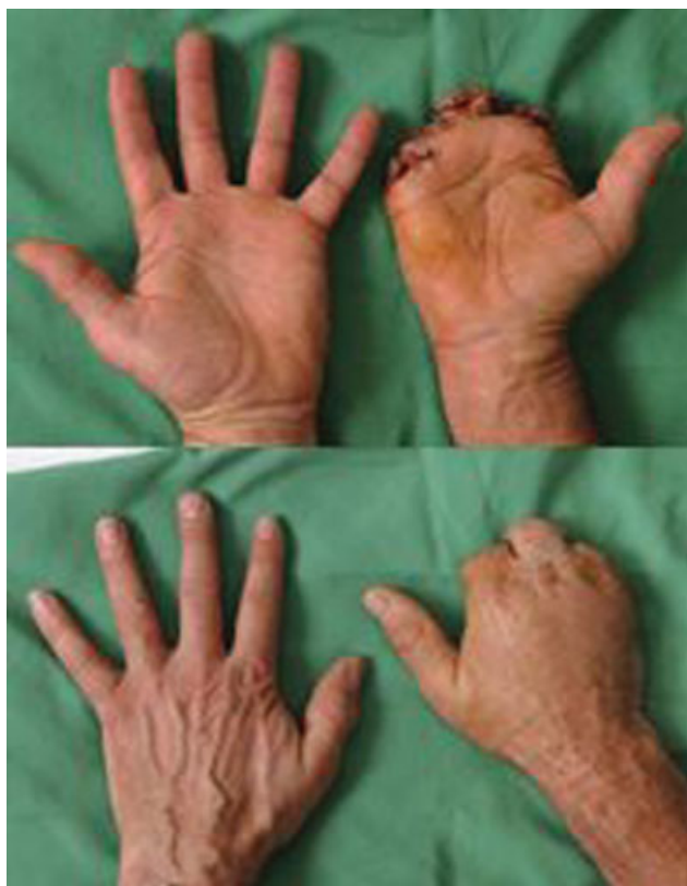
Fig. 1 Photograph of the patient during the first consultation at our service. He presents an acceptable stump for separate transfer of two toes to the radii of the third and fourth fingers.

After 5 years of follow-up, the patient presented a functional 3-finger gripper with adequate handwriting and flexion capacity of 80° in both metacarpophalangeal joints. The grip strength is of 37 kg in the left (unaffected) hand and of 12.2 kg in the right hand. The two-point tactile discrimination is of 6 mm and 10 mm for both ulnar and radial collateral