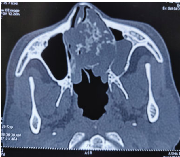
Fig. 1 Preoperative computed tomographic image.

Computed tomography scan of paranasal sinuses (→ Fig. 1) showed large expansile mass arising from the nasal septum