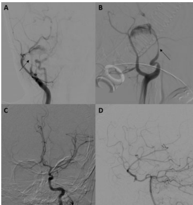
Fig. 2 Diagnostic angiogram showing contrast filling the pseudoaneurysm from cervical internal carotid artery (ICA) (black arrows in A and B) with absence of antegrade filling of distal ICA. Diagnostic angiograms showing filling of cavernous right ICA through anterior communicating artery (in C) and posterior communicating artery (in D).

cular pseudoaneurysm from the right cervical ICA. On cerebral angiography, the right anterior cerebral artery and middle cerebral artery were shown to fill from left ICA and right vertebral artery with good-sized anterior communicating artery and right posterior communicating artery (► Fig. 2). Right ICA was occluded proximal to the pseudoaneurysm with coils using a vertebral diagnostic catheter (Interlock-35, 6 mm × 100 mm, Boston Scientific). Antibiotics (cultures isolated Staphylococcus sp. ) were continued for up to 4 weeks in postprocedure period. No neurological deficits were seen at periprocedural period. Follow-up CT angiograms at 4 weeks showed thrombosed pseudoaneurysm with well-collateralized intracranial circulation (► Fig. 3). The child is well at 6 months of clinical follow-up.