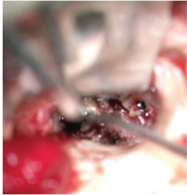
Fig. 4 Edited showing the dissection of the lesion from the promontory. The incudostapedial joint and stapedius tendon are seen.

If the tumor extended medial to the ossicles, the incus was dislocated from the stapes and removed to gain access. Tympanoplasty was performed, and the canal was packed with medicated gel film. The patients were alerted regarding the possibility of bleeding, hearing loss, facial nerve paralysis, taste disturbance, and tympanic membrane perforation. The follow-up protocol consisted of a computed tomography of the temporal bone with contrast at the end of 3 months to rule out any recurrence of the tumor. Those with persistent symptoms of tinnitus underwent computed tomography after 6 months