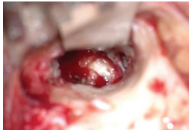
Fig. 5 Edited showing the ossicular chain, stapedius tendon and round window niche after tumor removal.