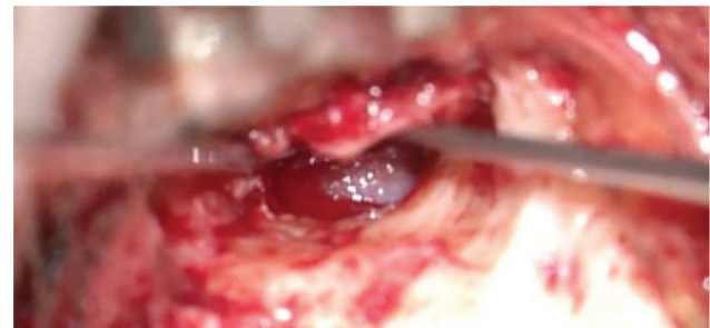
Fig. 1 Edited showing the tumor after elevation of the tympanomeatal flap.

The extent and margin of the tumor were examined all around. The drilling commenced in the posterosuperior region of the external auditory canal and the outer attic wall to expose the ossicles. → Fig. 2 The tumor could then be easily dissected around the ossicles, thus preserving the hearing. Thereafter, the drilling was performed judiciously in the posteroinferior part as the facial nerve runs lateral to the tympanic annulus in this region. The hypotympanic air cells were then exposed, and the tumor was delineated all