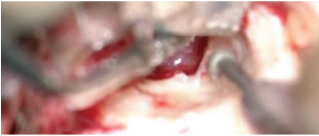
Fig. 2 Edited showing the drilling in the posterosuperior region of the external auditory canal.