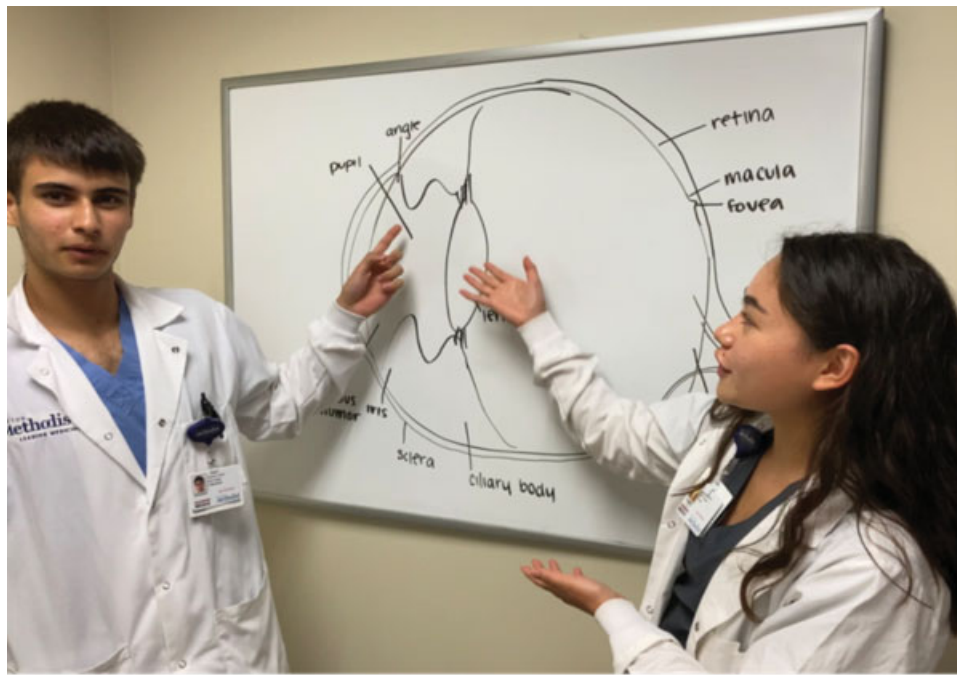
Fig. 1 Filming the YouTube Eyewonder video.