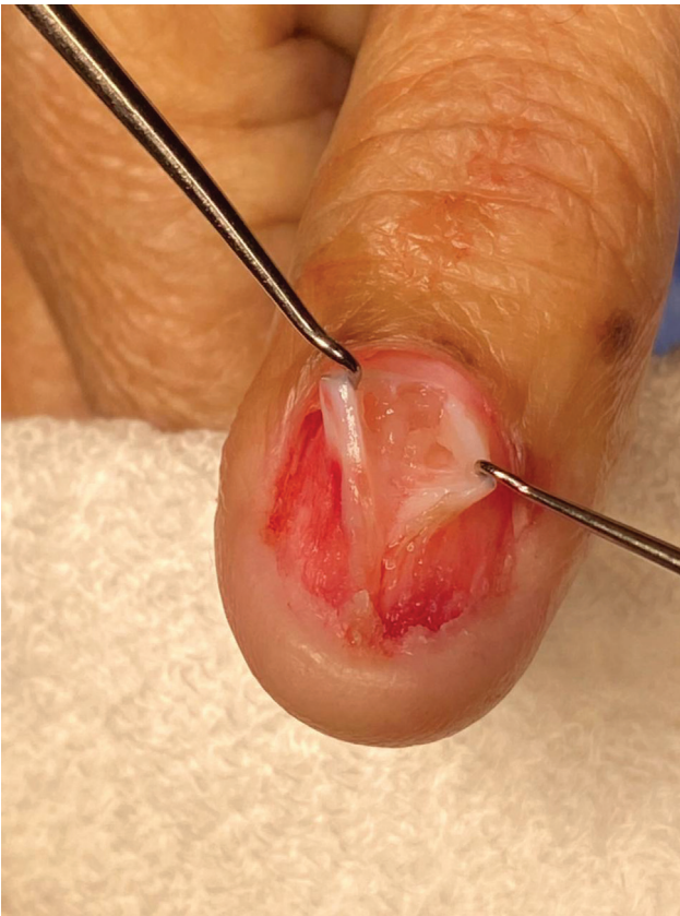
Fig. 1 Subungual glomus tumor.