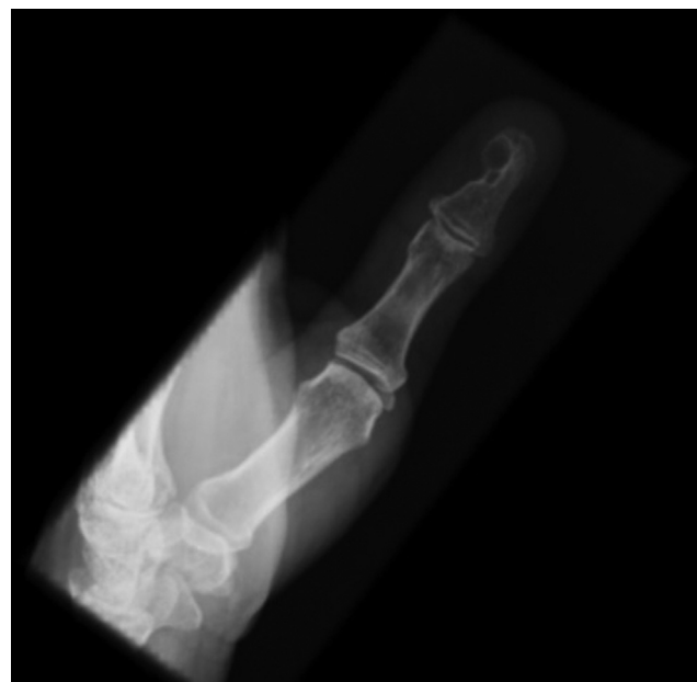
Fig. 4 Radiograph showing bone involvement after recurrence of a glomus tumor.

histological type contribute more to its recurrence than failures of the surgical procedure. We believe that this is a