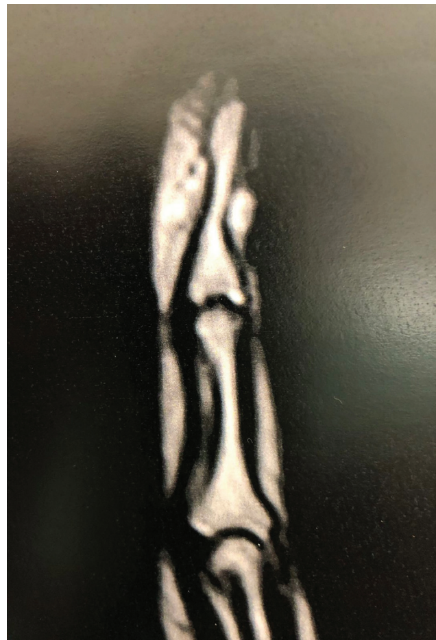
Fig. 3 Magnetic resonance imaging scan of a finger showing a subungual glomus tumor.

In our sample, more than half (6 out of 11) of the patients who had recurrence also had a further episode of recurrence, which leads us to believe that it is possible that inherent characteristics of the tumor, such as gene expression and