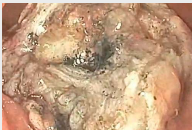
► Video 1: Full-thickness resection of a rectal scar using a modified over-the-scope clip.

A 51-year-old woman presented with rectal bleeding. Colonoscopy revealed a 2.5 cm rectal polyp at 15 cm from the anus, which was successfully removed via piecemeal endoscopic mucosal resection (EMR). Histopathology showed traditional serrated adenoma with high grade dysplasia and a focus that was suspicious for intramucosal adenocarcinoma. Posi-