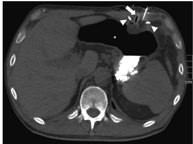
► Fig. 2 The final CT-scan shows the blocked PRG (fat arrow) in a 55 year old patient, the two gastropexy-anchors (arrow heads) and the 22 G cannula (slim arrow) for air injection to inflate the stomach (Asterisk).

During our CT-guided PRG placements the median DLP was 657 mGy*cm. To date there are no published data regarding radiation exposure for CT-guided PRG. With only four patients our subgroup can only show a tendency. In this case, evaluations of larger patient cohorts in the course of further studies are needed.