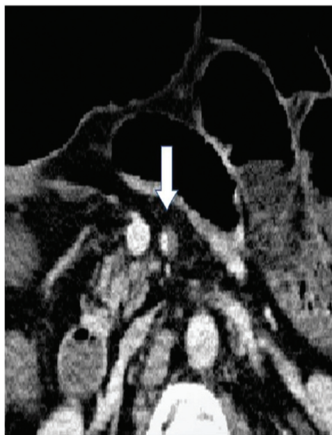
Fig. 2 Dissection of the superior mesenteric artery is observed, with hematoma occlusion of the false lumen.

small bowel, portal vein pneumatosis, and dissection of the SMA (→ Fig. 1 ). The patient was in a state of panperitonitis, and emergency surgery was suggested for ischemia and necrosis of the small intestine due to dissection of the SMA (→ Fig. 2 ). The patient was sent to the operation room, and during the surgery, the small intestine was found to be poorly colored for 25 cm starting from a point 100 cm from the ligament of Treitz (→ Fig. 3 ); therefore, partial resection of the small bowel was performed.