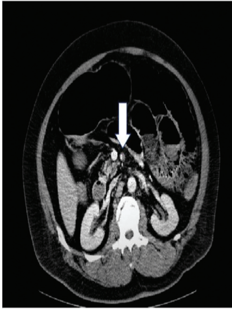
Fig. 1 White arrow indicate dissociation of the superior mesenteric artery. Pneumatosis intestinalis is observed (the white arrow indicates a dissected SMA).

small bowel, portal vein pneumatosis, and dissection of the SMA (→ Fig. 1 ). The patient was in a state of panperitonitis, and emergency surgery was suggested for ischemia and necrosis of the small intestine due to dissection of the SMA (→ Fig. 2 ). The patient was sent to the operation room, and during the surgery, the small intestine was found to be poorly colored for 25 cm starting from a point 100 cm from the ligament of Treitz (→ Fig. 3 ); therefore, partial resection of the small bowel was performed.