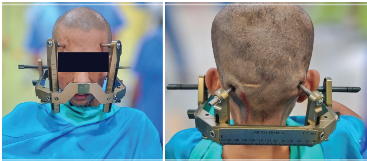
Fig. 1 Application of stereotactic frame before computed tomography (CT) scan of a patient undergoing awake surgery.

The surgical approach used for STN-DBS has evolved. For frame-based DBS since 2013, three software navigation systems have been used: Frame-Link software (Medtronic, Inc.) till 2018, Medtronic StealthStation S7 navigation system in 2019, and Medtronic StealthStation S8 DBS software starting in 2020. Based on the navigation system, the anatomical STN targeting, trajectory planning, selection of entry point (marked), and the stereotactic frame setting were done (→ Fig. 3). By altering the navigation system, there was no effect on the operating techniques, the lead's final placement, or the clinical outcome. However, the procedure was significantly simpler because of the upgradation of the tool. A burr hole was made at the chosen entry point. Fibrin glue was administered after dural opening to restrict cerebrospinal fluid (CSF) egress that could potentially lead to brain shift and malposition of leads. Microelectrode drive was then attached with the stereotactic frame, which enabled microelectrode recording (MER) and microstimulation by a trained neurophysiologist (→ Fig. 3). Platinum-iridium glass-coated microelectrodes having an impedance of roughly 0.3 to 0.5 ohm ( \Omega ) were used for microelectrode mapping. These platinum-iridium microelectrodes can record single units of activity and are used for microstimulation of up to 100 mA without significant quality degradation of the recording.