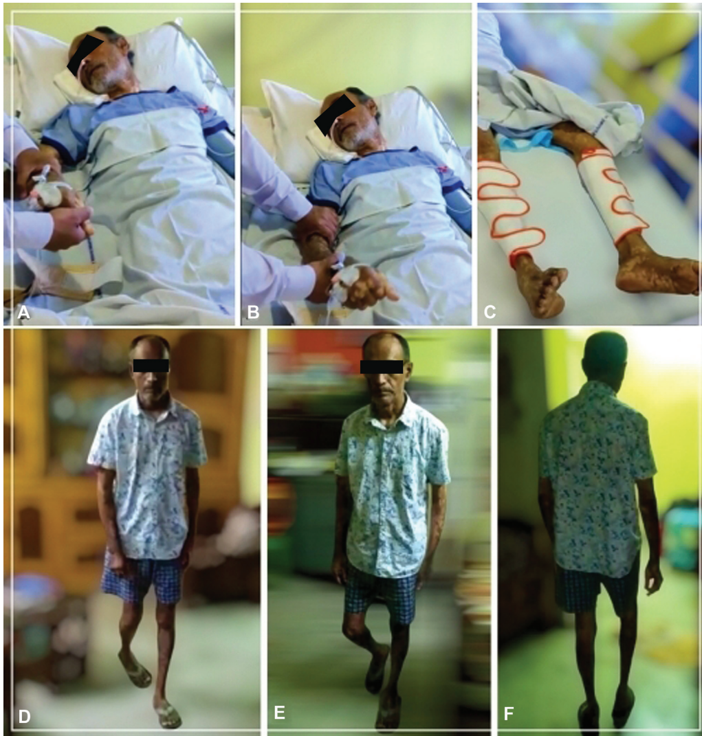
Fig. 4 (A–C) Preoperative images showing severe rigidity of all limbs and hypokinesia of a patient undergoing subthalamic deep brain stimulation and (C–E) postoperative outcome (ambulant without support).