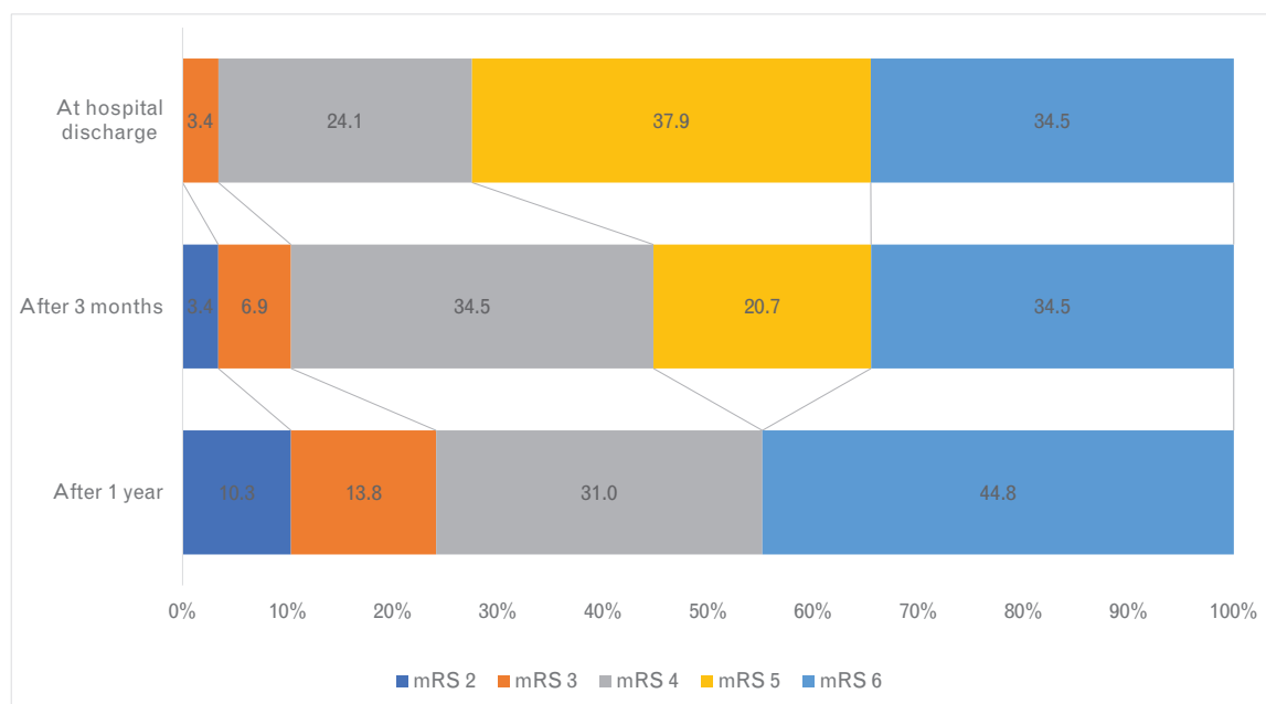
Figure 2 Modified Rankin scale (mRS) distribution at discharge, after 3-months, and after 1-year of stroke in the subgroup of patients younger than 60 years treated with decompressive craniectomy within 48 hours from symptom onset.