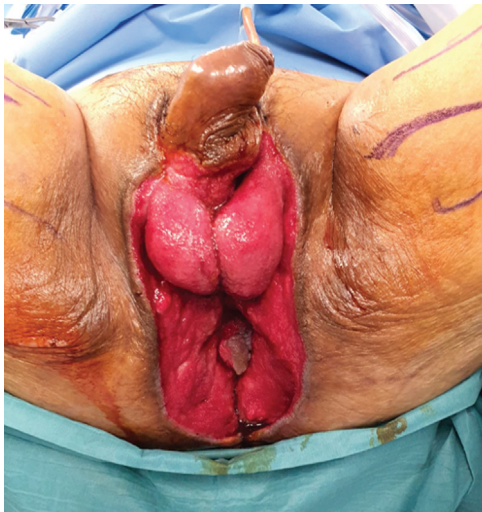
Fig. 3 Resultant wound defect prior to flap reconstruction.