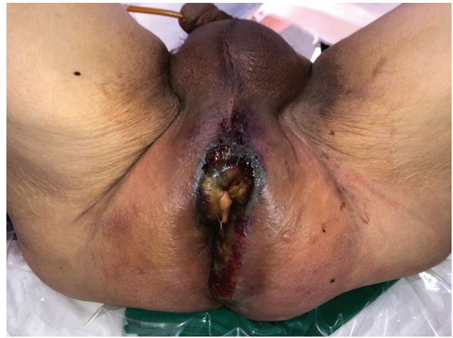
Fig. 1 Initial presentation of the perineal region to the emergency department.