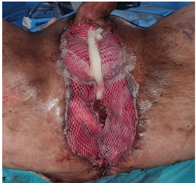
Fig. 7 Skin grafts for resurfacing of raw surface.