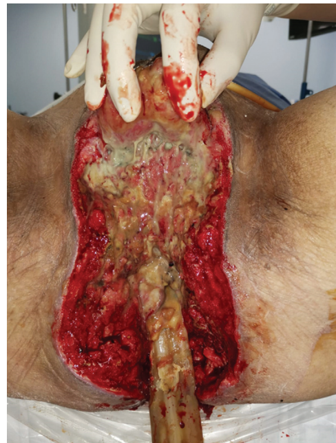
Fig. 2 Hand holding bilateral scrotum up. Persistent soilage of wound.

muscles had to be debrided by the colorectal surgeon (senior author), and resulting in incontinence,