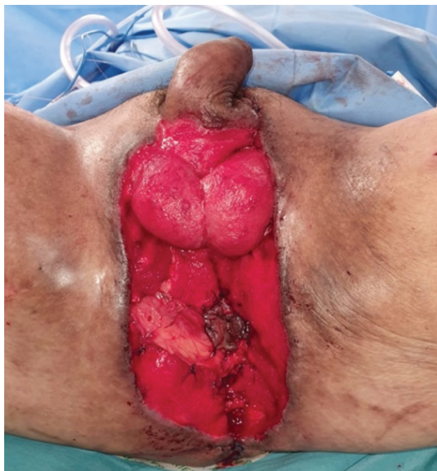
Fig. 5 Final inset of flaps for the creation of neoanus.

to that of a camera shutter (► Figs. 4 and 5 ). Thus, the double-opposing gracilis flaps formed a camera shutter, with the anal mucosa as its “aperture,” sprouted at the epicenter of the two muscle flaps (► Figs. 5 and 6 ). When both the gracilis muscles were activated, they would shorten and narrow the aperture of the anus, closing the anus and preventing leakage. The gracilis muscle flaps were anchored with vicryl 2/0 and vicryl 3/0. Split-thickness skin grafts were used to resurface the rest of the skin defect (► Fig. 7 ). Wound inspection on postoperative day 12 showed that the flap and the skin graft have contracted, forming a clear channel suitable for the passage of feces. During the patient’s inpatient stay, his glycemic control was also maintained within an acceptable range.