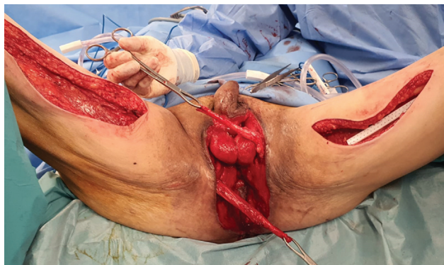
Fig. 4 Harvest of bilateral gracilis flaps and inset of flaps.