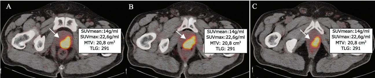
Fig. 2 Pretreatment gallium-68-labeled prostate-specific membrane antigen (Ga-68-PSMA) positron emission tomography/computed tomography (PET/CT) images of a 59-year-old prostate cancer (PCa) patient categorized as Gleason score (GS): 4 + 5, D’Amico high risk, high-risk Candiolo (HRC), metastatic tumor. Summary of maximal standardized uptake value (SUVmax), mean SUV (SUVmean), metabolic tumor volume (MTV), and total lesion glycolysis (TLG) values derived from primary prostate tumor (arrow) on axial fused pretreatment 68Ga-PSMA PET/CT images of a patient with low risk (A–C).

was the only parameter that showed significant differences between all risk subgroups (► Table 6).