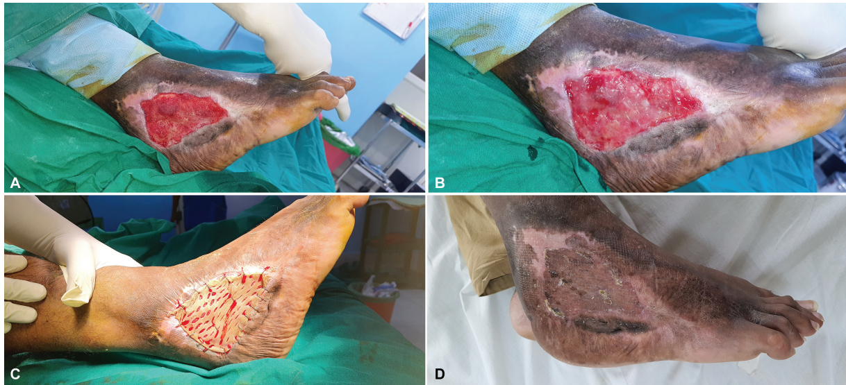
Fig. 1 (A) Recurrent chronic ulcer in the lateral aspect of the right ankle region. (B) Soft-tissue defect covered with dermal matrix. (C) Soft-tissue defect covered with skin graft following dermal matrix application after 1 week. (D) Late postoperative picture showing adequate healing and durable skin grafted site.

NPWT was applied postoperatively. Additionally, the patient received a series of six HBO therapy sessions to further enhance wound healing. The patient's postoperative course