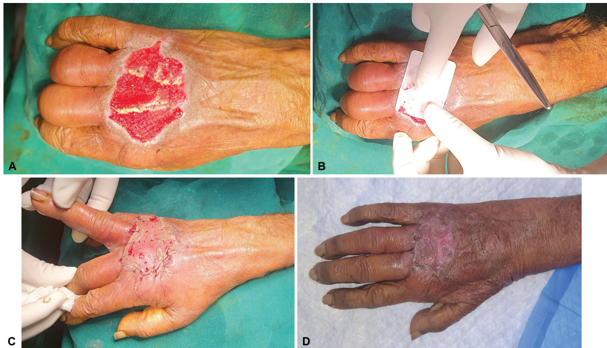
Fig. 3 (A) Soft-tissue defect exposing the extensor tendon: dorsum of the right hand. (B) Soft-tissue defect covered with dermal matrix. (C) Soft-tissue defect with dermal matrix covered with skin graft. (D) Late postoperative picture showing adequate healing and durable skin grafted site.

reconstruction, promoting regeneration in deep burns, chronic wounds, and full-thickness defects. Dermal matrix act as a scaffold, encouraging cell growth and neovascularization. 5 As the healing process progresses, the fibroblasts deposit new extracellular matrix, and the dermal substitute gradually resorbs. Studies have shown that various dermal substitutes have comparable engraftment and vascularization rates. 6 Notably, dermal matrix offers a distinct advantage as it allows for immediate STSG without compromising graft success. 7 Traditionally, dermal substitute placement involves a staged surgical approach. In stage 1, the wound is debrided, the dermal substitute is applied, and NPWT is used. Then, after a 1-week interval, stage 2 involves skin grafting with continued NPWT.