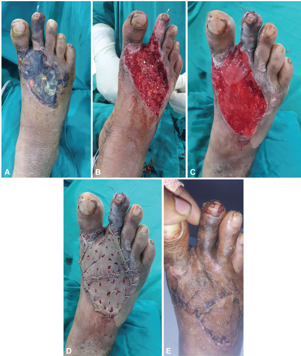
Fig. 4 (A) Necrotic tissue following trauma: right foot dorsum. (B) Soft-tissue defect exposing the extensor tendon and the metatarsophalangeal joint of the second toe: dorsum of the right foot. (C) Soft-tissue defect covered with dermal matrix. (D) Soft-tissue defect with dermal matrix covered with skin graft. (E) Late postoperative picture showing adequate healing and durable skin grafted site.

sessions, while chronic conditions like radiation illness might necessitate 50 to 60 sessions. 11-13 This pressurized environment can promote wound healing in several ways. The increased pressure can cause temporary vasoconstriction, leading to a reduction in swelling and edema around the reconstructed area. This can improve oxygen delivery to the newly grafted tissue with the dermal substitute. Hyperoxygenation within the chamber may stimulate the immune system by improving white blood cell function and their ability to respond to infection by effective phagocytosis. 13 Additionally, it can promote neovascularization in areas with low oxygen levels by stimulating fibroblast activity and capillary growth. 14 These factors can contribute to a more optimal integration of the dermal substitute and skin graft. Our study's findings suggest that HBO therapy allows for a