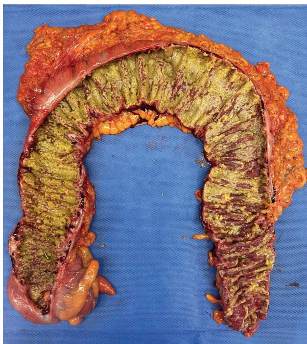
Fig. 2 Surgical specimen with colonic wall thickening and pseudomembranes on the mucosa.

pressor requirements, and a change in mental status prompting emergent intubation for airway protection. The colorectal surgery team was consulted for evaluation of fulminant colitis. The patient was taken for emergency surgery and a