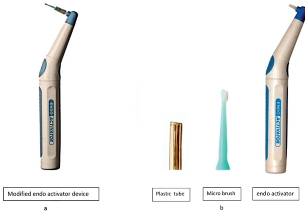
Fig. 1 (a) Modified sonic micro-brush assembly. (b) The components used to fabricate modified sonic micro-brush assembly, which include plastic tube, micro-brush, and endo-activator device.