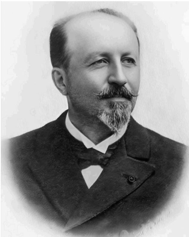
Figure 1 Professor Fulgence Raymond (1844–1910).

farmers from humble origins. 1,3,4 Influenced by his father, Raymond enrolled in the École Impériale Vétérinaire de Maisons-Alfort in 1861. Graduating in 1865, he quickly rose to become professor and head of the anatomy and physiology department by 1866. 1,3–6 Subsequently, he showcased his expertise as a veterinarian at the École de Cavalerie , in Saumur, demonstrating remarkable skill in both veterinary medicine and equestrianism. 1,3,4