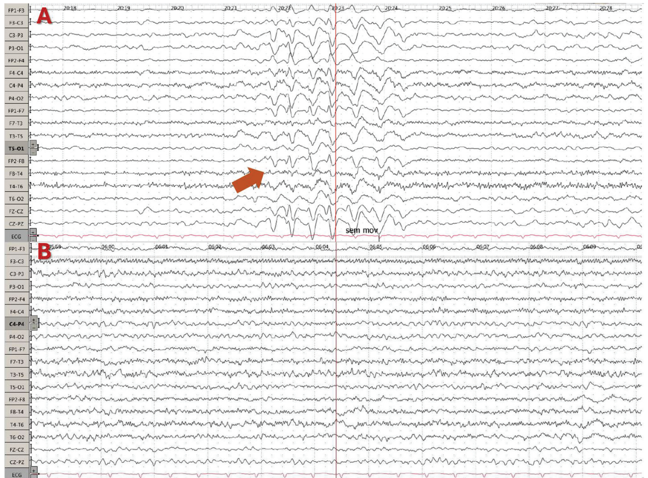
Figure 2 (A) Four days after the onset of symptoms. Second EEG after 1 day of levetiracetam introduction, showing partial improvement. (B) Eight days after the onset of symptoms. Third EEG, showing complete resolution.