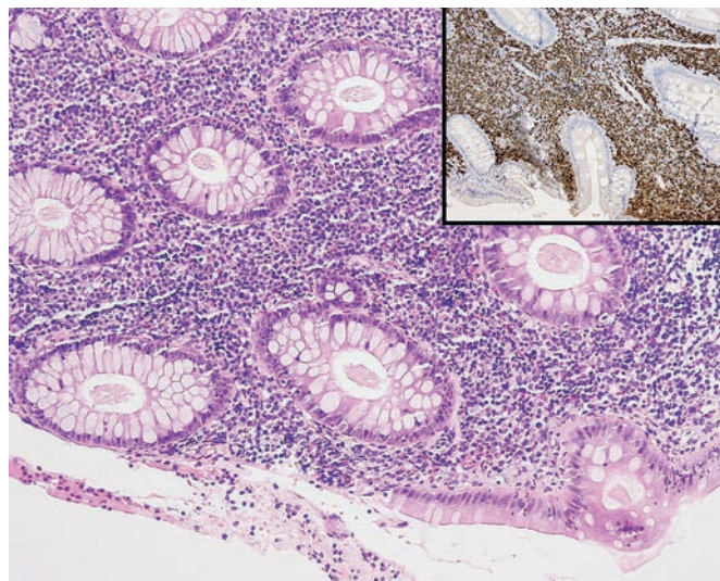
Figure 2 Histopathological examination of the polypoid lesion revealed a dense, atypical mononuclear infiltrate (hematoxylin–eosin, original magnification 50 ×). A full blood count was repeated and, surprisingly, a 49% rate of blast cells was now found. Bone-marrow puncture revealed a 100% rate of blast cells. Pre-B-cell leukemia was diagnosed. Immunohistochemical studies of the biopsies from the polypoid lesion revealed CD10-positive B-cell proliferation. Inset: terminal deoxynucleotidyl transferase (TdT). Chemotherapy (vincristine, dexamethasone, asparaginase and triple intrathecal therapy) was started, and the patient's abdominal pain and other symptoms subsequently disappeared. After induction chemotherapy, the girl was in remission. As this case shows, a polypoid lesion in the gastrointestinal tract may be the first presentation of acute leukemia; awareness of this possibility may expedite the diagnosis.