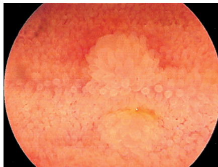
Figure 1 A 45-year-old Peruvian nun was referred to us for investigation of severe weight loss (more than 9 kg in 1 week) and asthenia. Esophagogastroduodenoscopy and total colonoscopy were negative, but terminal ileoscopy revealed an isolated finding of an enlarged submucosal follicle.