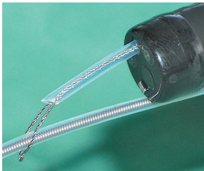
Figure 1 Sliding the endoscope and snare, using the ligating device as a guide wire.

After the ligating device has been cut and the endoscope has been withdrawn, a diathermy snare is introduced through the endoscope's working channel, outside the patient, and fully opened. The proximal end of the ligating device is then passed through the snare, which is closed