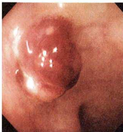
Figure 1: Solitary juvenile polyp in the lower sigmoid colon.