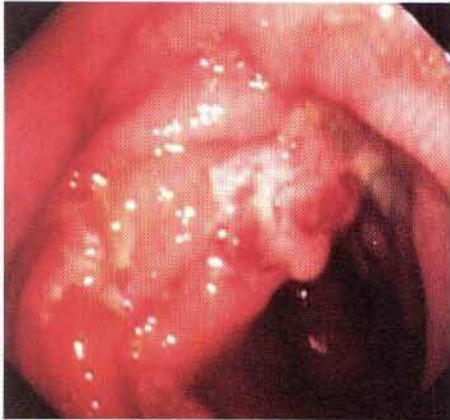
Figure 1: A patient with colonic tuberculosis. Colonoscopy shows two ulcers within a hyperemic nodular mucosa in the proximal colon.