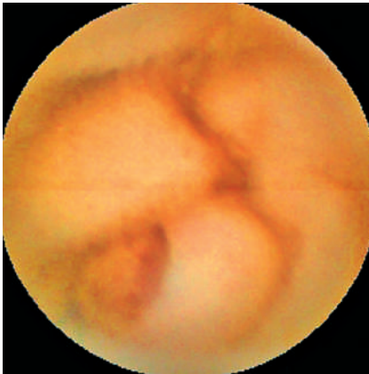
Fig. 1 Capsule endoscopy revealed a polypoid lesion in the small bowel, with surface ulceration.